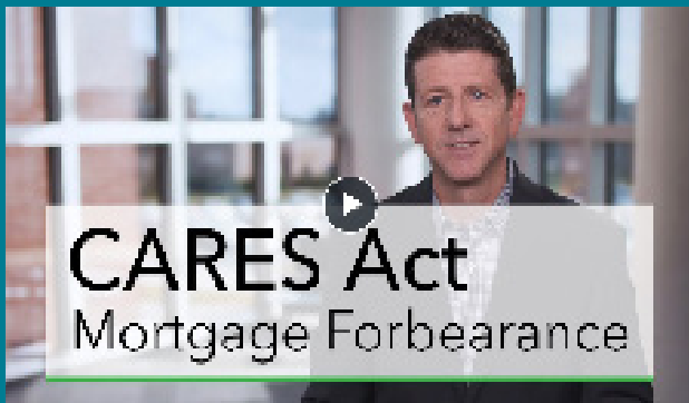
CARES Act Mortgage Forbearance: What You Need to Know